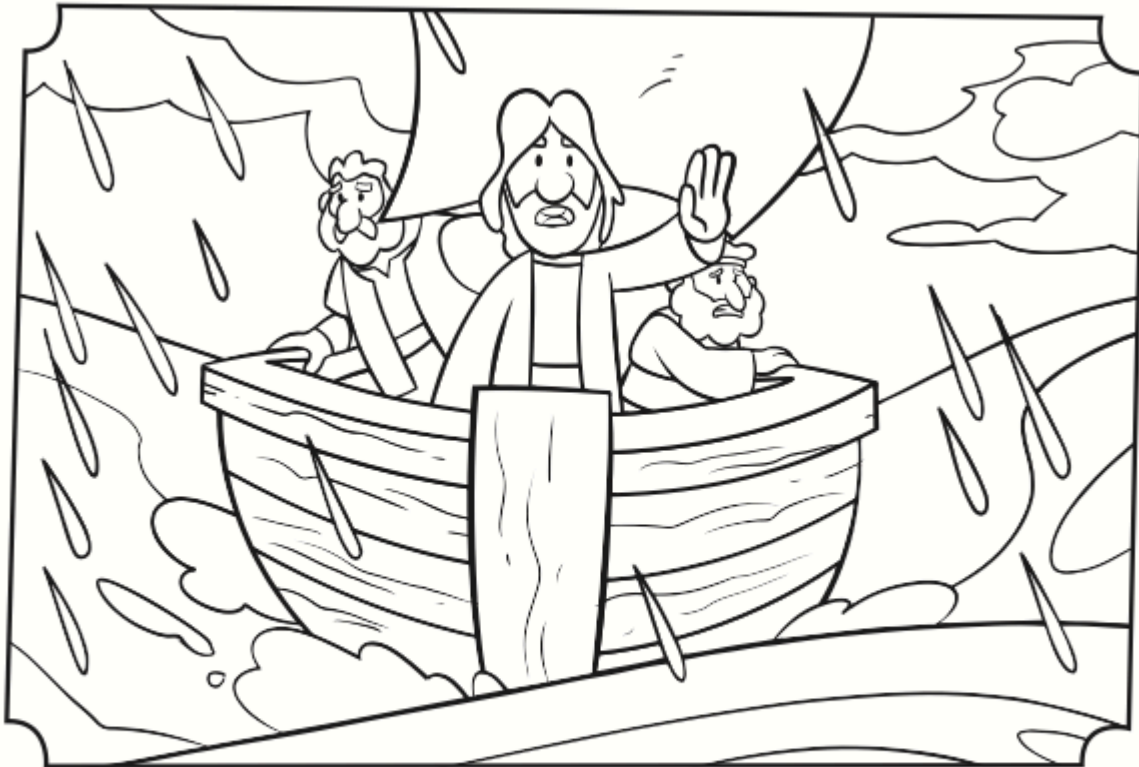
Jesus calmed a storm while He and His disciples were on a boat. Mark 4:35-41