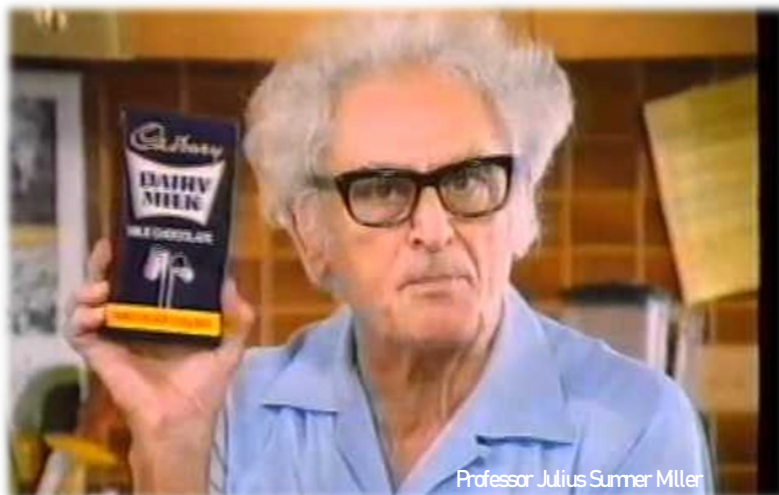
Professor Julius Sumner Miller

My grandmother recounted her experience of starvation as a WWII refugee under Japanese military occupation in Manila, and then the relief she had as a mother that she could scrape up rotten pota-