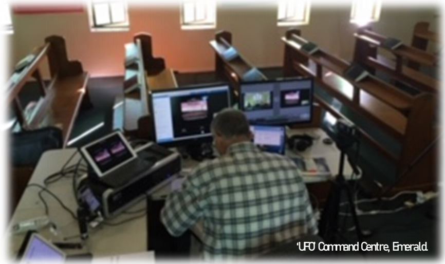
'UFO Command Centre, Emerald.